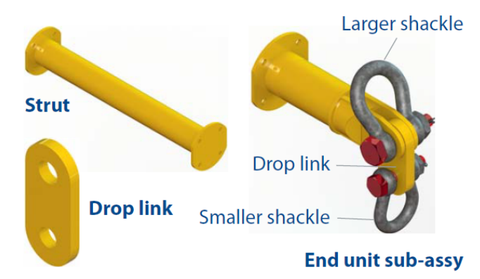
Table 1 – Component List