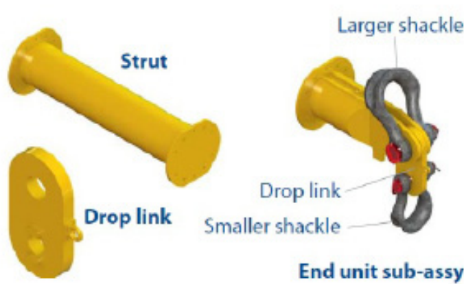
Table 1 – Component List