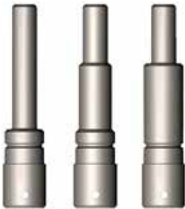
Load Pin Details