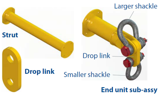
Table 1 – Component List