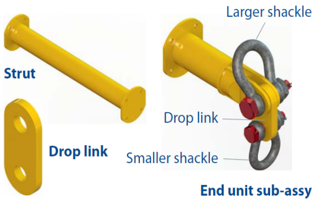
Table 1 – Component List