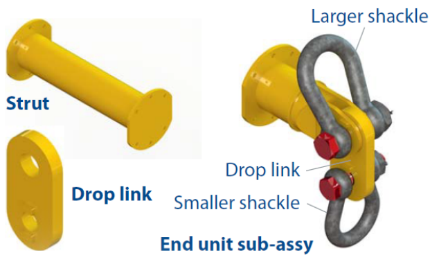
Table 1 – Component List